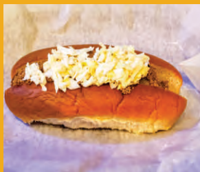
HALF SHELL DOG