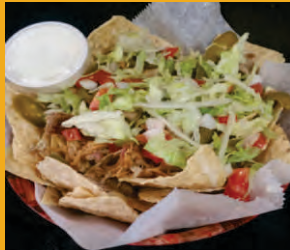
HALF SHELL NACHOS