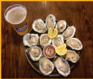
RAW ON THE HALF SHELL