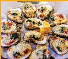
BAKED OYSTERS #5