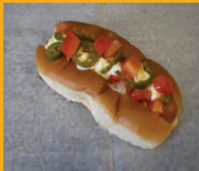
TEX MEX DOG