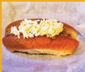
HALF SHELL DOG

THE "HALF SHELL" DOG $5.00 (CHILI, CHEESE & SLAW) L.A. "Lower Alabama" DOG $5.00 (HOMEMADE SQUASH RELISH, MAYO, ONION) TEX-MEX DOG $5.00 (CHEESE, JALAPENOS, TOMATO, MAYO) NEW YORK STYLE DOG $5.00 (SAUTEED ONIONS IN SAUCE W/ SPICY MUSTARD) CHICAGO STYLE DOG $5.00 (PICKLE, PEPPER, TOMATO, CELERY SALT, ONIONS & MUSTARD) WICKED PIMENTO DOG $5.00 (TOPPED WITH MELTED PIMENTO CHEESE ) STEWDOG $5.00 (TOPPED WITH BRUNSWICK STEW ) (Each Additional Toppings-$ .50)