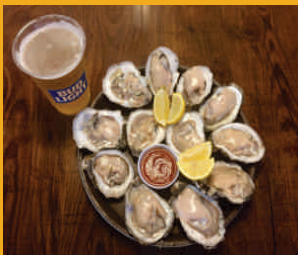
RAW ON THE HALF SHELL