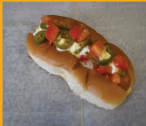
TEX MEX DOG