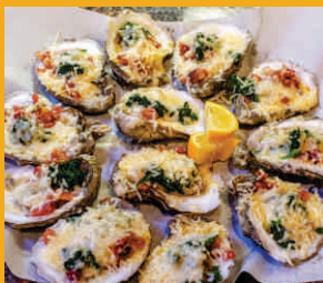
BAKED OYSTERS #5