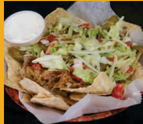
HALF SHELL NACHOS