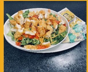
HALF SHELL SALAD