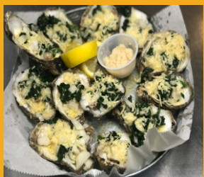
BAKED OYSTERS #5