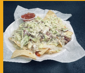
HALF SHELL NACHOS