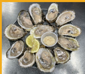
RAW ON THE HALF SHELL