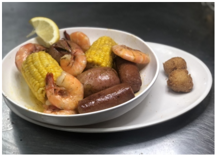
(Lower Alabama) Country Boil - $15.95 (Includes: Jumbo Shrimp, Corn, Potatoes, Sausage & Hush Puppies or Roll)

SEAFOOD PLATTER ( SHRIMP, OYSTERS, SCALLOPS, GROUPER & CATFISH) - $27.95 “ALL PLATES ABOVE SERVED WITH 2 SIDES AND CHOICE OF HUSHPUPPIES OR ROLL”