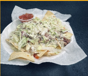
HALF SHELL NACHOS