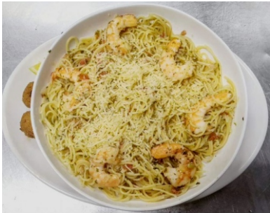
(Shrimp Scampi - $15.95) (Angel Hair Pasta Topped with Jumbo Shrimp in Herb Butter Sauce & Hush Puppies or Roll)