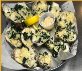
BAKED OYSTERS #5