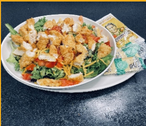
HALF SHELL SALAD