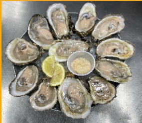
RAW ON THE HALF SHELL