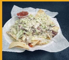
HALF SHELL NACHOS