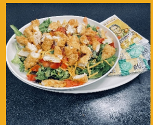
HALF SHELL SALAD